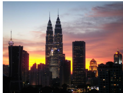
1MDB is based in Malaysia's capital, Kuala Lumpur

"Investigators are focusing on whether Goldman failed to comply with the U.S. Bank Secrecy Act."